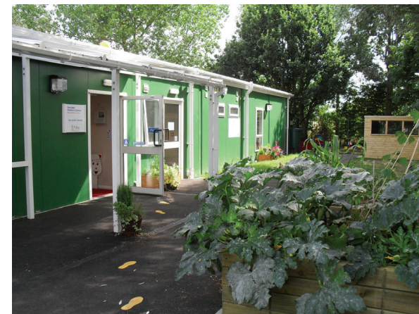
Briary Children's Centre in the sun