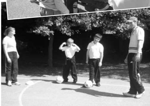
Here some of the week 53 visitors are having a go at some physical activities provided by Vista leisure.