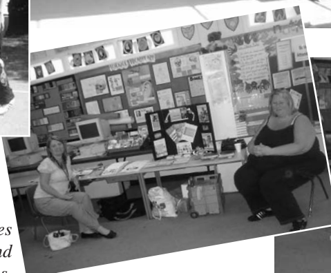
The Children's Information Services were on hand to give advice and information on all children's services.