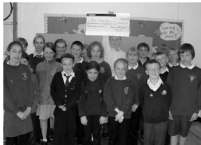
Pictured are members of the council who initiated and oversaw the fundraising.

Deal/Sandwich cluster have formed a Consortium Council which includes two pupils from each primary school in the cluster. These representatives meet termly at local schools to provide a stronger 'pupil voice' for primary children in the Deal/sandwich area. The first collaboration of the schools involved 'Red nose day',