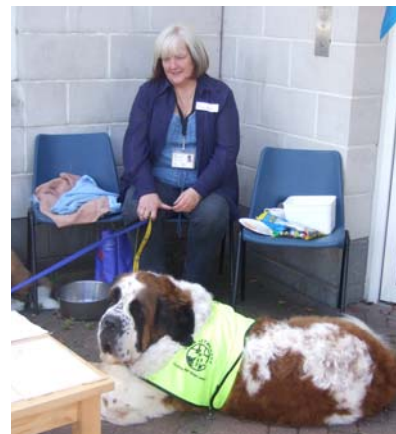
Guess the Weight of Elaine's Dogs MAC, guessed nearest the dogs weight won the Guess the Weight of the Dogs Competition Bonny weighed 12st 10lb Bumber weighed 14st 6lb