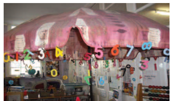
The Numbrella inspiration!

In the outdoor area, children have a dedicated music space where they can explore sounds made with stimulating 'found and free' instruments of different materials – metal colanders, CD racks, pans, metal fruit baskets, wooden spoons, metal and plastic lids. One three year old was observed using her imagination to create and 'play' her own personal trumpet from an unidentifiable metal utensil as she proudly paraded around with other children joining in her imaginary band.