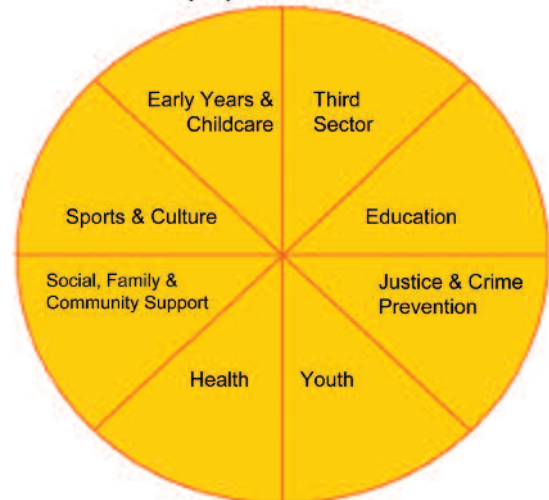
The eight sectors that make up the children's and young people's workforce

The essential next step that the draft Workforce Strategy proposes is, that all KCT partners include 10 key standards in their own workforce strategies. This will give a common baseline for more effective integrated working across the whole workforce. Through working together in partnership, and guided by this new approach, the Trust aims to shape and support the workforce to deliver the best possible services for children, young people and families in Kent.