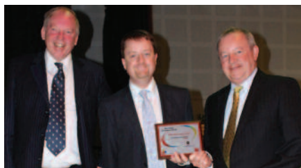
Ofsted Outstanding Governing Body Shatterlocks Infant School