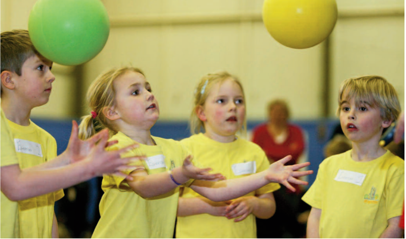
More than 80 children from eight schools in Ashford and Maidstone, pictured, took part in the Kent School Games Multiskills event for Mid Kent and Ashford in March.