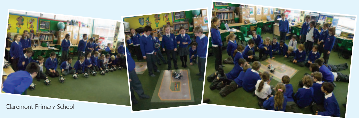
Claremont Primary School

For more info see www.nationalcollege.org.uk/