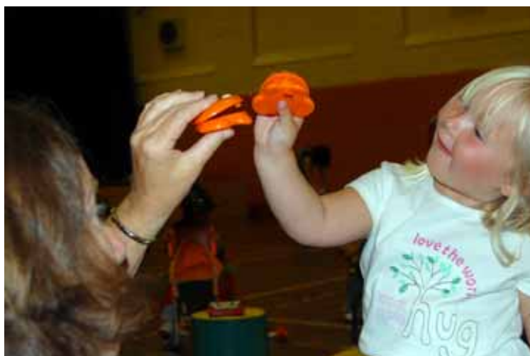
Northgate Drop In