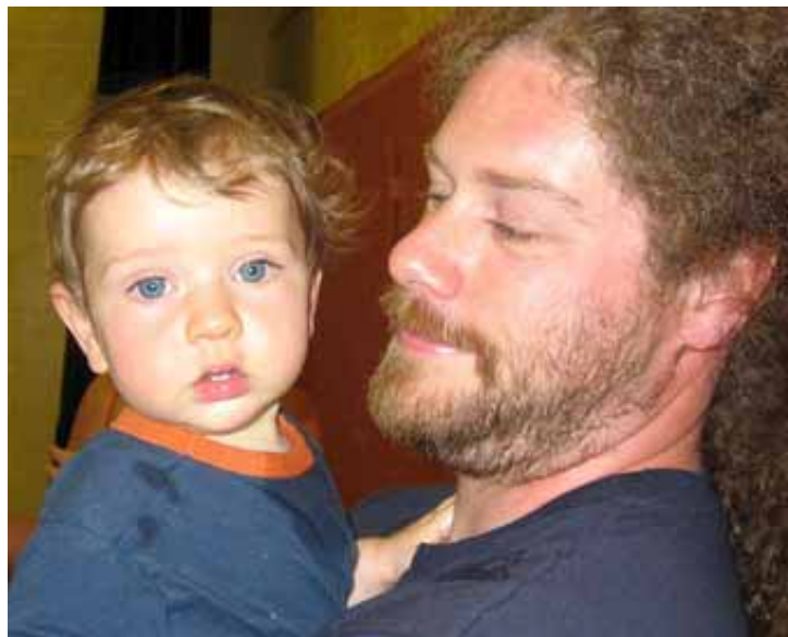
Northgate Dad's Group

We also conducted more intensive focus group sessions with two of the groups, CDEYP Breakfast Club and CDEYP drop-in at Poets Estate.