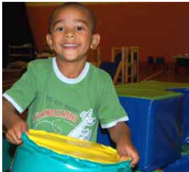
Northgate drop in